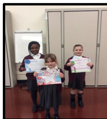
Our Out of School Achievement Children!