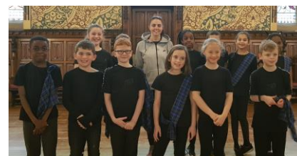
Class 5H - 2 nd Place

Pictures also on the 'Home' page of the school website