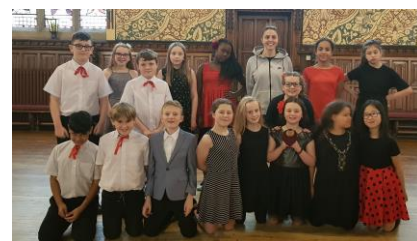
Class 5E - 1 st Place