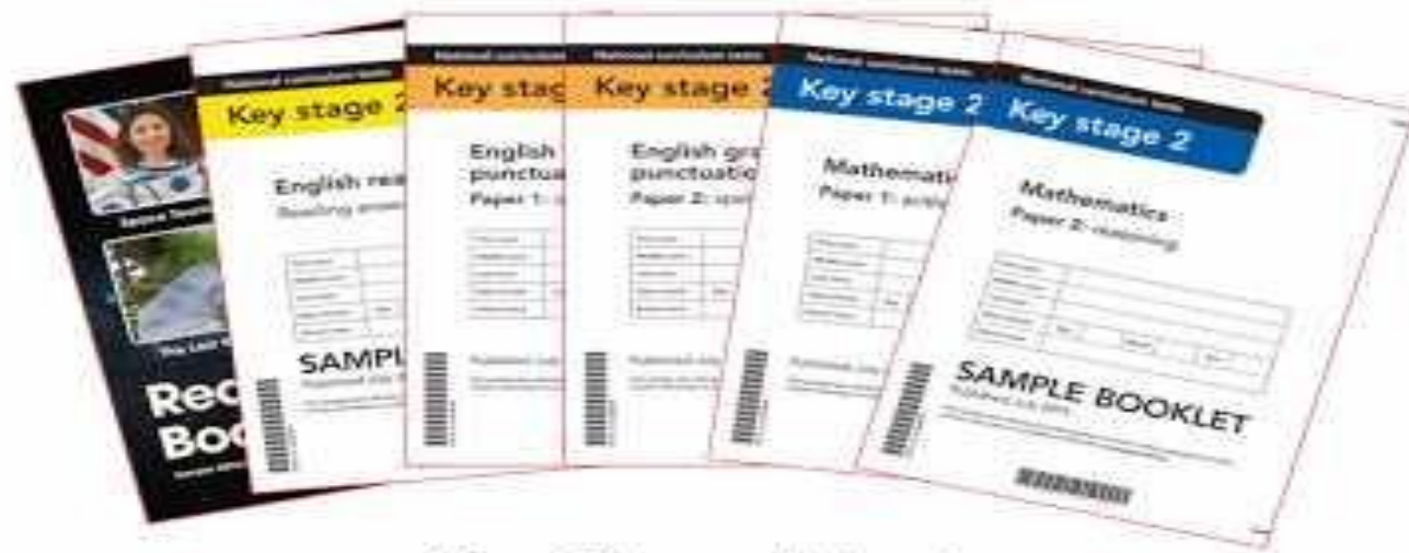
Key Stage 2 tests