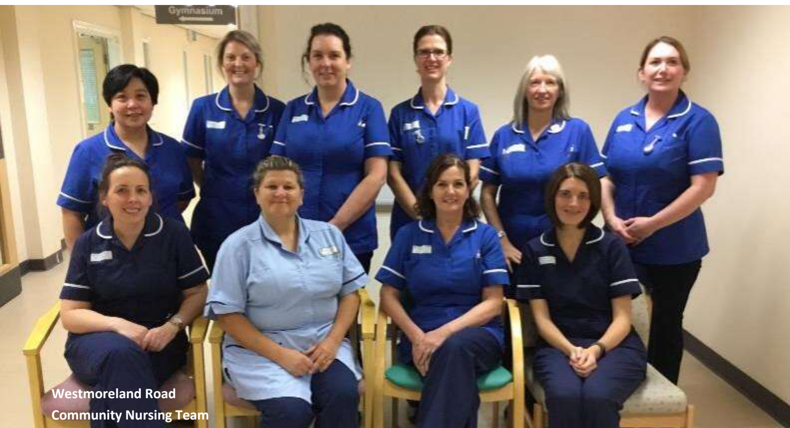
Westmoreland Road Community Nursing Team

As a district nurse you would lead and support a Community Nursing Team to deliver care in a variety of community settings including the Patients' homes, Residential Homes, Sheltered accommodation, GP Surgeries, Community Clinics.