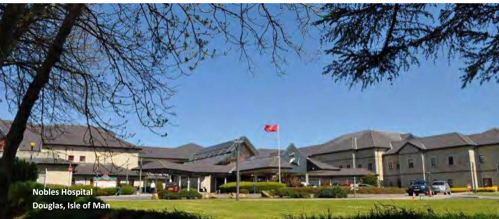
Nobles Hospital Douglas, Isle of Man

Hospital nursing on the Isle of Man will provide you with an exciting and rewarding career where you can make a difference to the patients you care for.