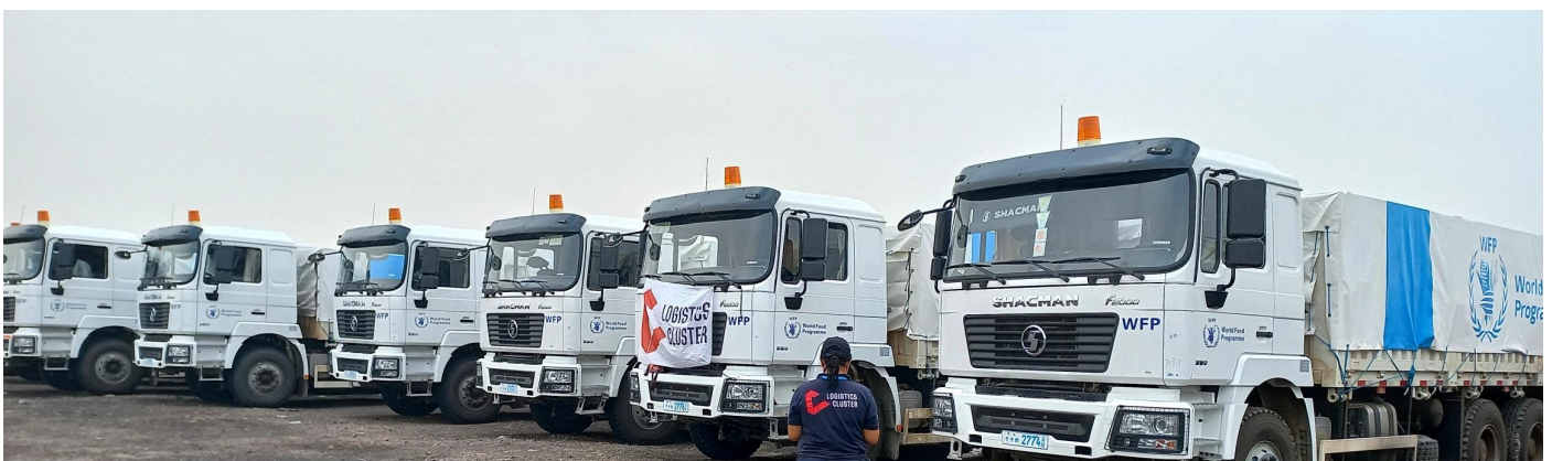
Trucks lining up in Semera ready to join the convoy to Mekele (Tigray).