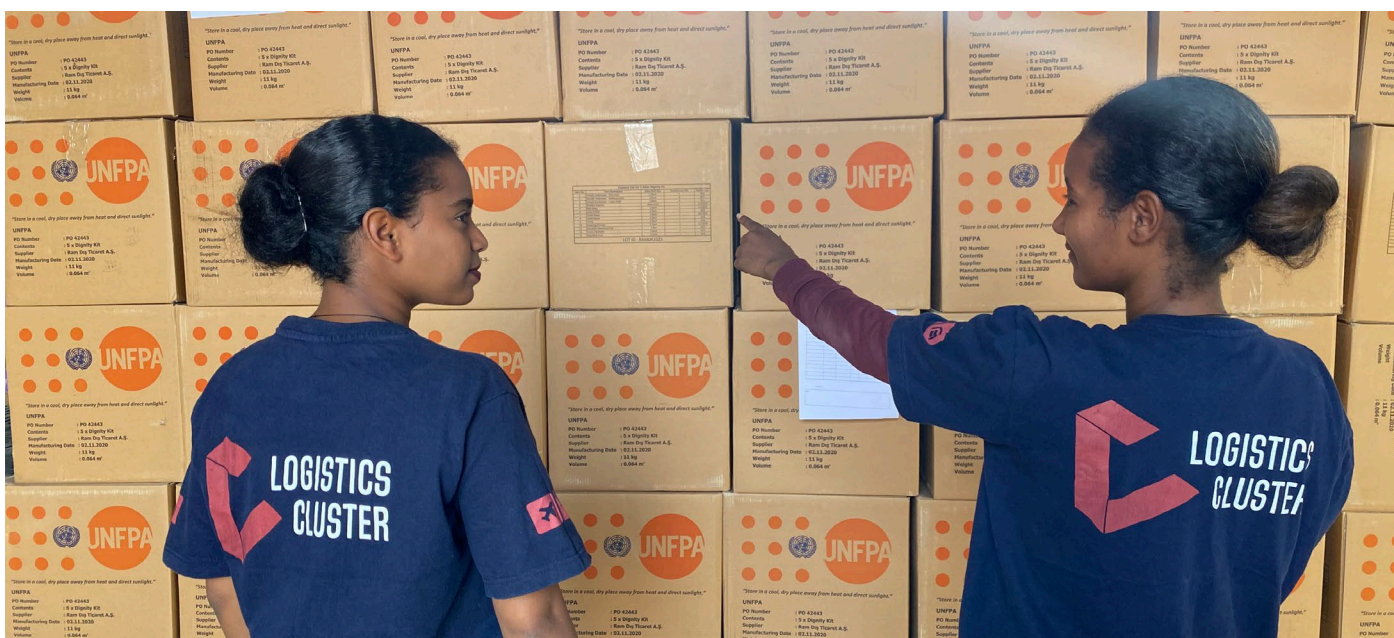
The Logistics Cluster team in Mekele at the warehouse.