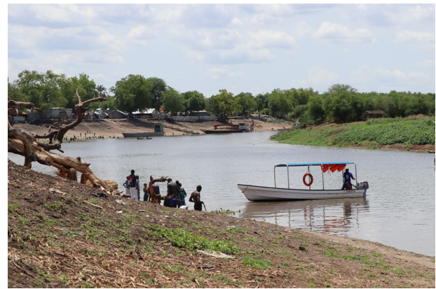
The Logistics Cluster served Akobo for the first time by river instead of air.