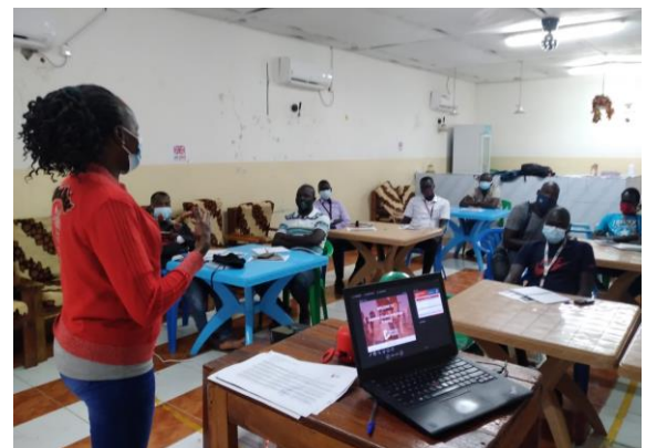
The Logistics Cluster Induction Training in Malakal.