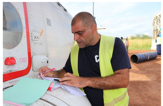
The Logistics Cluster facilitates access to two helicopters in Bor to support the flood response.