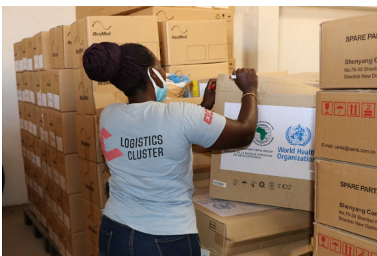
More than 10 million PPEs from the common pool have been allocated.

WFP, through the Logistics Cluster, as a co-lead of the Operational Support and Logistics Pillar of the National COVID-19 Response Plan, continues to coordinate requests for Personal Protective Equipment (PPE) from humanitarian organisations. As of 31 October 2021, 584 requests for PPEs from the common pool created by WHO, WFP and IOM have been accepted, allocating more than 10.3 million PPEs to be received in more than 250 locations across South Sudan.