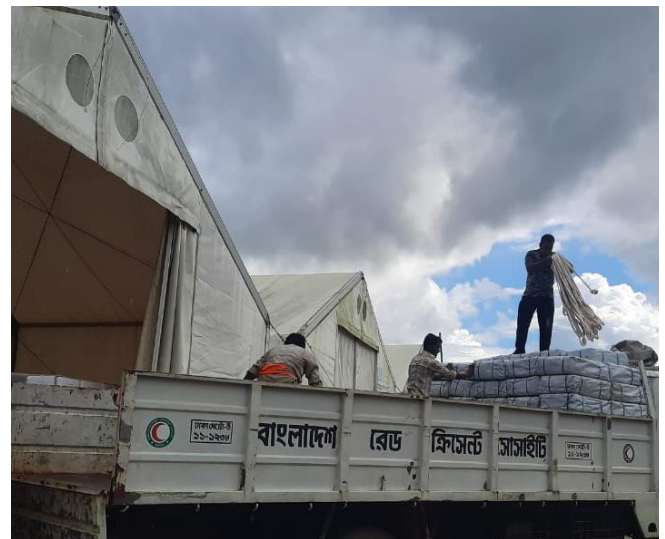
Tarpaulin dispatch at the Logistics Sector warehouse.