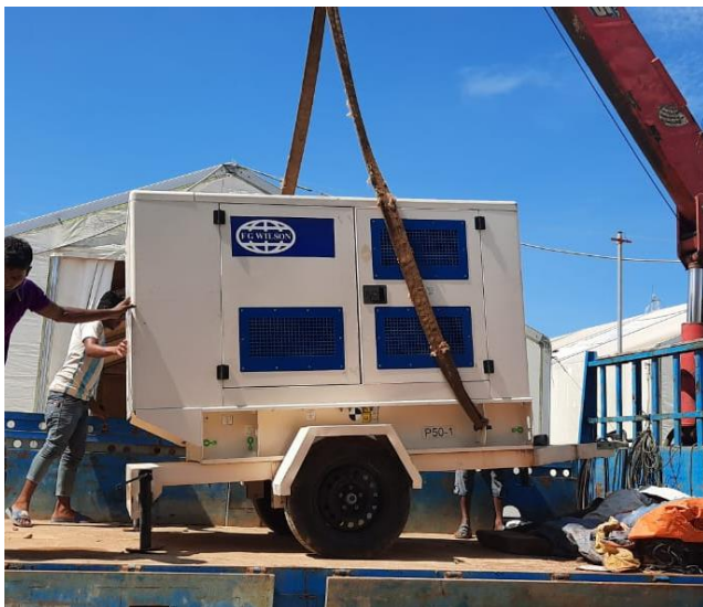
The Generator set loaned to power a clinic.