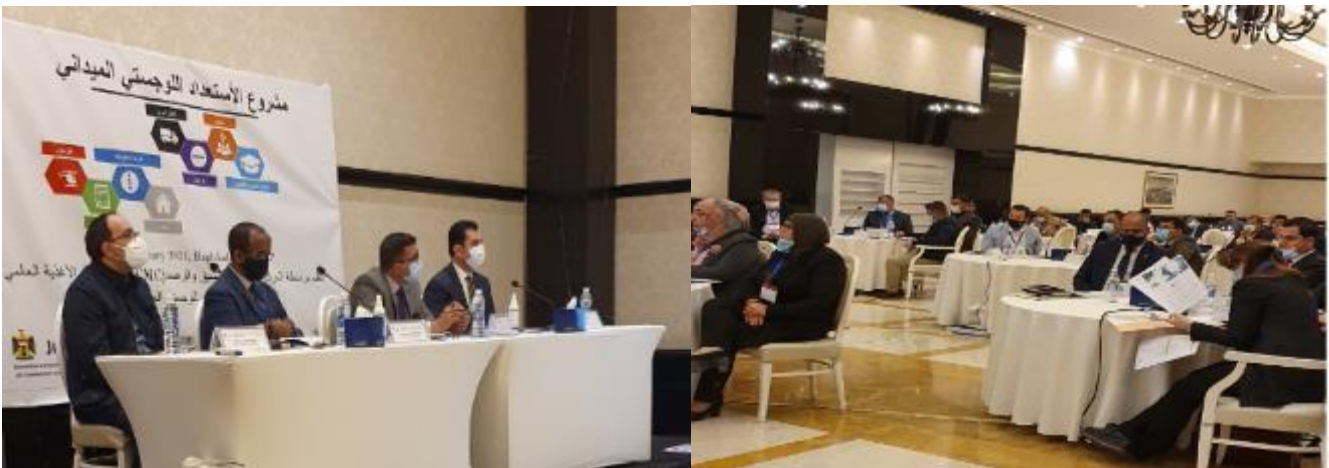
From the right: WFP Supply Chain officer, WFP Country Director, Head of JCMC, and Head of JCC heading the meeting