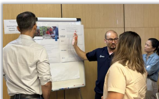
Preparedness Officer presenting Bhutan's country case in Supply Chain capacity strengthening engagement through the FBPP during the regional Supply Chain Country Capacity Strengthening workshop