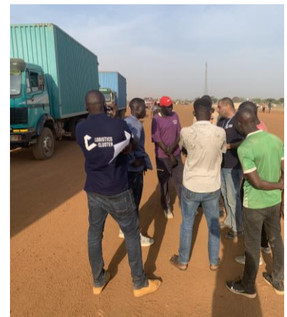
Dry season Prepositioning, Bor South Sudan