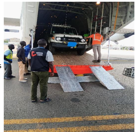
Loading WHO Landcruiser for cholera response, Juba to Renk, South Sudan