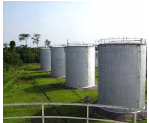
SEP- Congo depots- Kisangani Simi- Simi

The major oil companies working in the DRC are: Shell, Fina, Total, Engen, COHYDRO, Congo Oil, Cobil