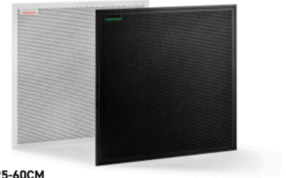
MXA925-60CM Ceiling Array Microphones Front