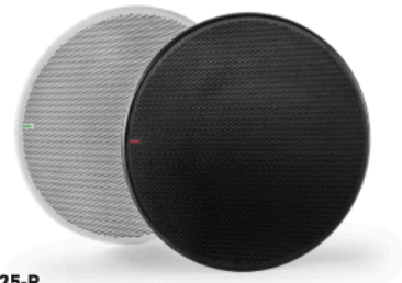
MXA925-R Ceiling Array Microphones Front