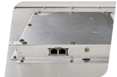
Dual RJ45 Network Ports