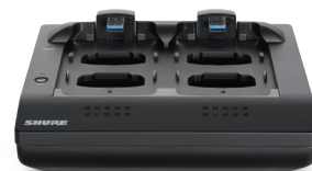
MXWNCS4 Networked Charging Station