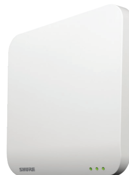
MXWAPT Access Point Transceiver