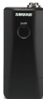
MXW1 Bodypack Transmitter