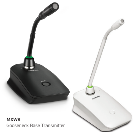
MXW8 Gooseneck Base Transmitter