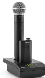
MXWNCS2 Networked Charging Station shown with MXW2/SM58 and MXW6