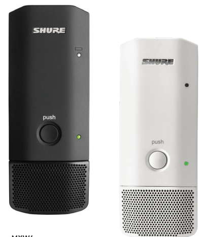
MXW6 Boundary Transmitter