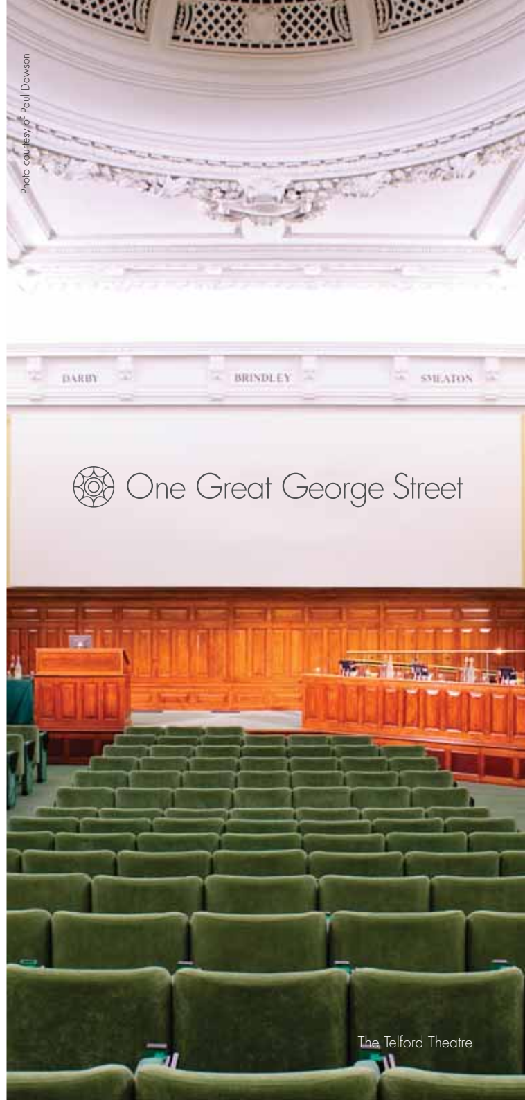
The Telford Theatre