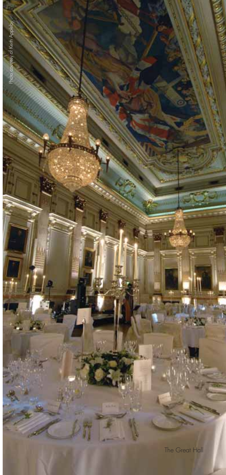
The Great Hall