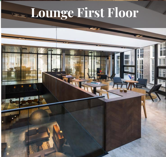
Lounge First Floor