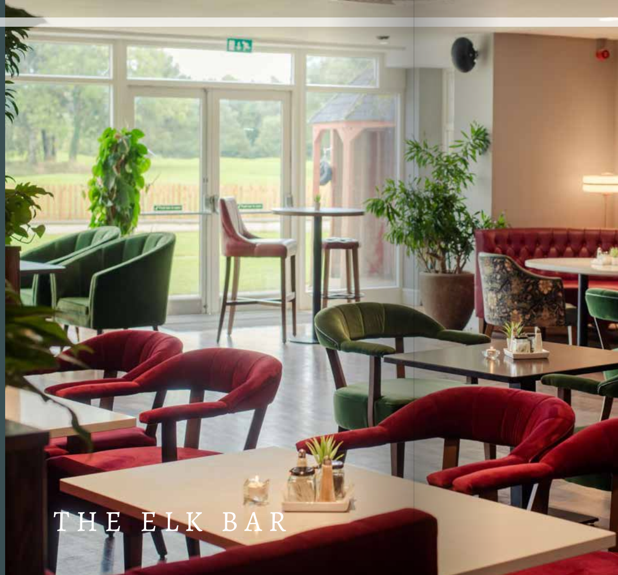
THE ELK BAR