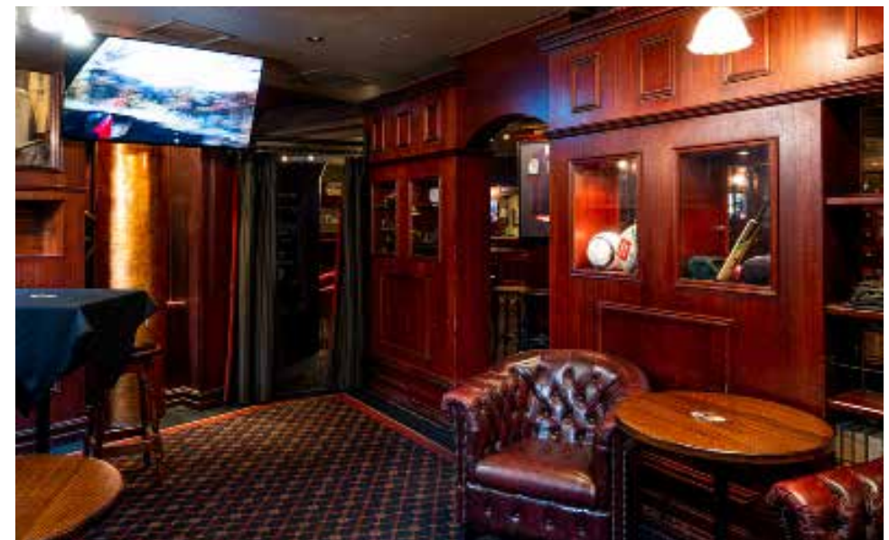
BOOKIES ROOM 15 SEATED / 25 STANDING