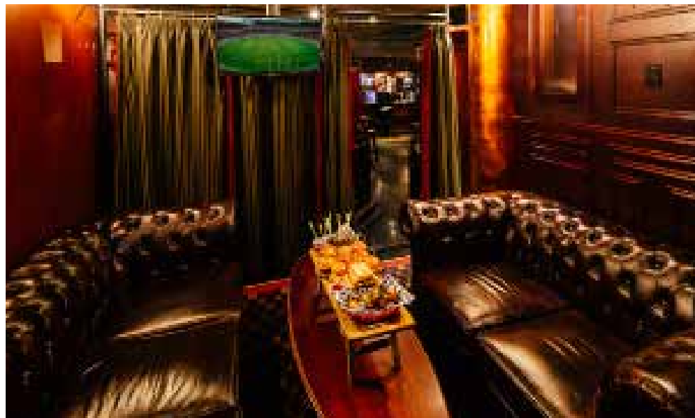
CHESTER ROOM UP TO 6 SEATED