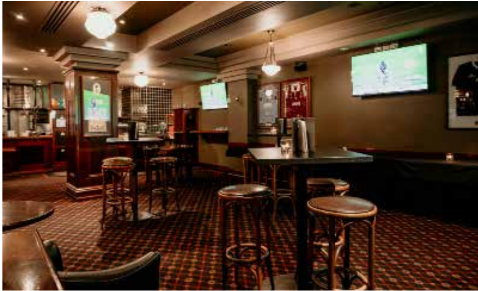
RESTAURANT AREA 60 SEATED / 80 STANDING