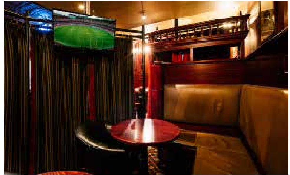
WHITE ROOM UP TO 8 SEATED