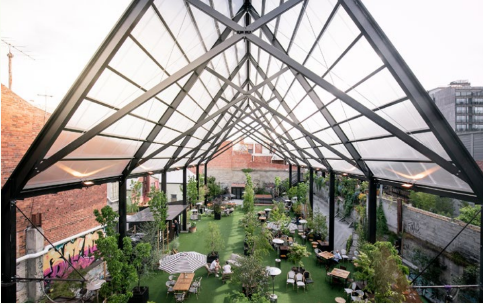
The Cathedral boasts a large, outdoor space, protected from the elements.