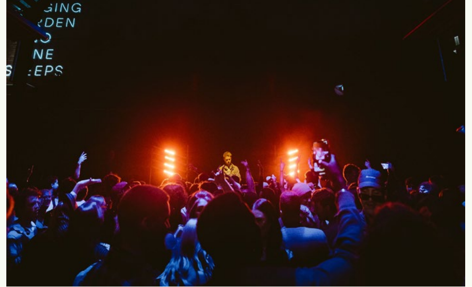
The Cathedral comes alive at night with live DJs Friday + Saturday.