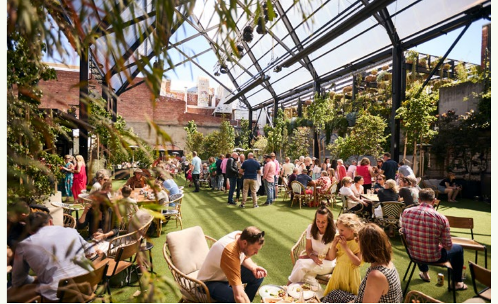
The Cathedral, by day is a sun-filled venue for all ages.