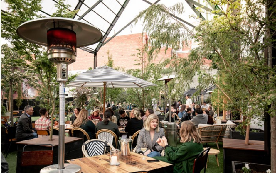
The Cathedral is a verdant sanctuary, suitable for any weather.