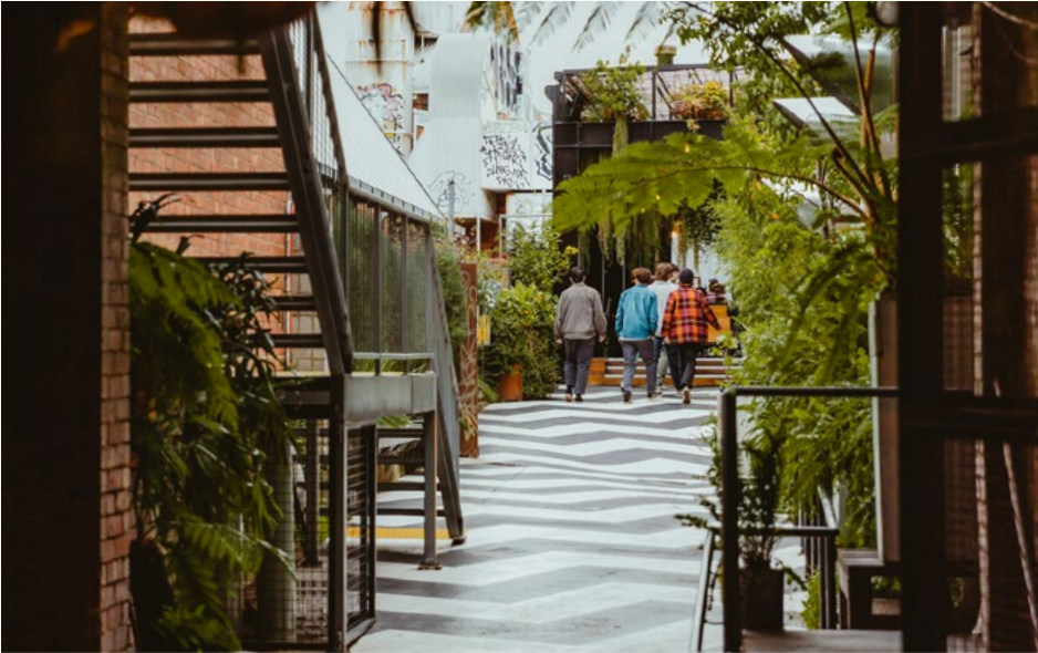
The chevron path leads you to the Garden.