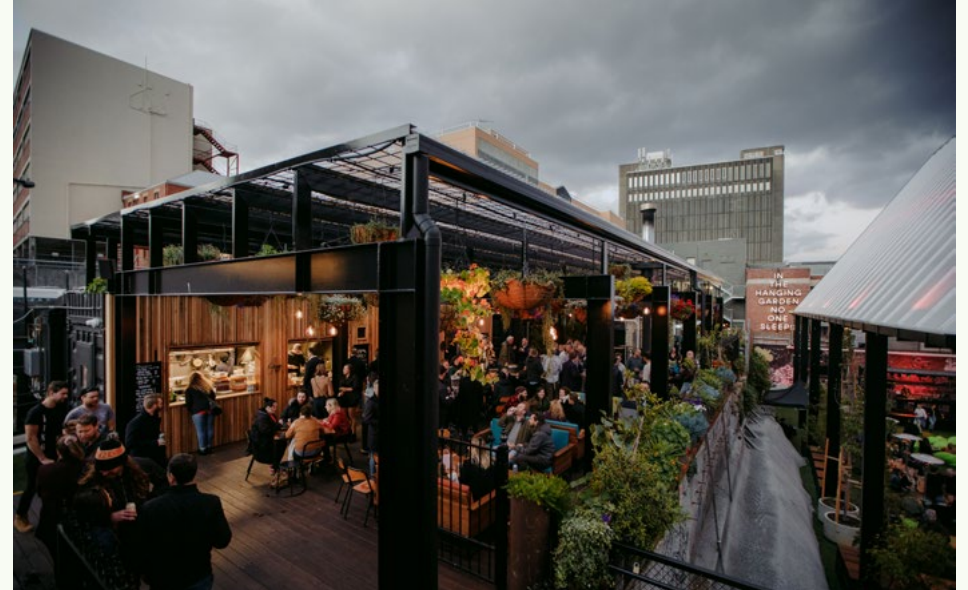
The Garden is home to diverse dining options, lots of seating and a toasty fireplace.