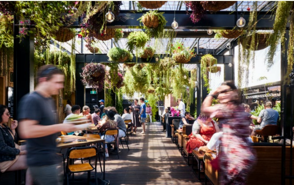
The Garden deck. A bustling, plant-filled eden.