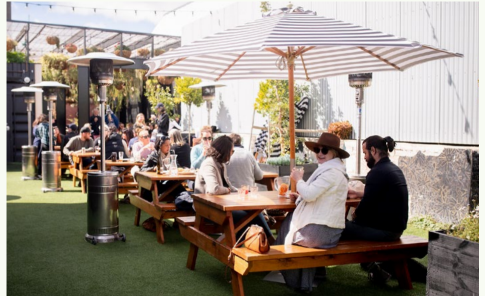
The Garden is a perfect spot to relax in the sun.