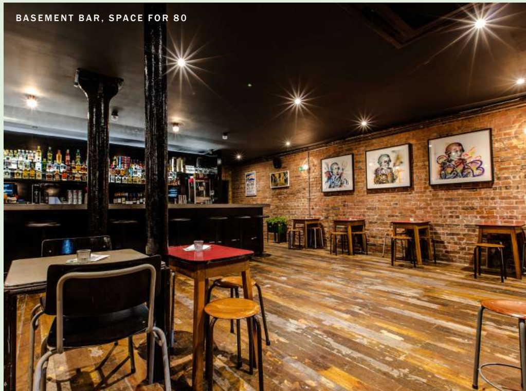
BASEMENT BAR, SPACE FOR 80