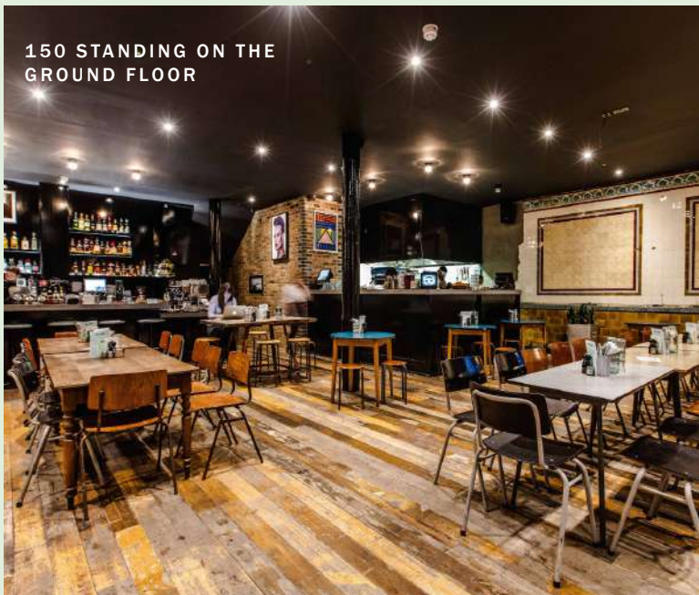
150 STANDING ON THE GROUND FLOOR

If you prefer to take a load off you can sit for a plated lunch / dinner of some of our à la carte menu favourites or enjoy the family style approach of the feasting menu where you can all tuck in together. Book to eat upstairs in the restaurant or keep it casual downstairs in the basement.