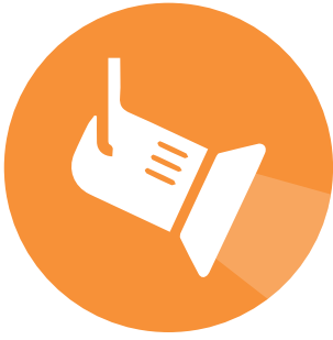
Special Effects (Signs on Doors)