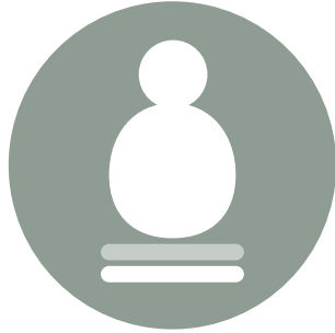
Booster Seats (Available from shop on Level 2)