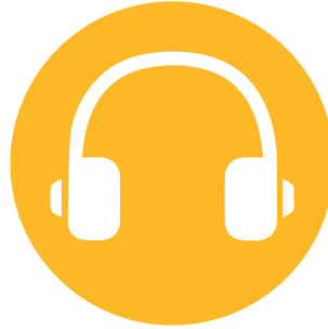
Ear Defenders (Available from shop on Level 2)