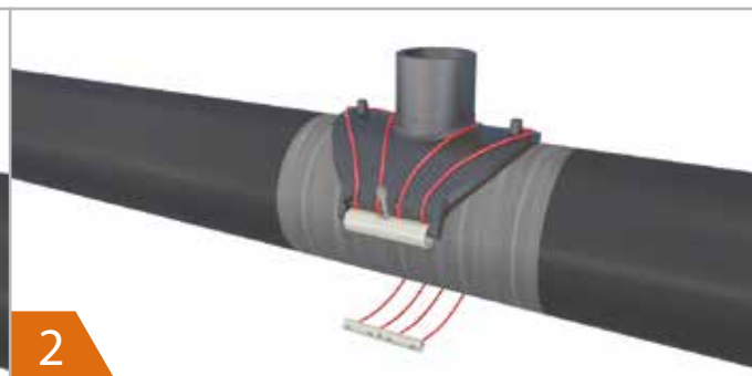
2 Fit clamp system around pipe.