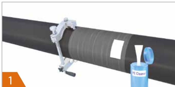
1 Scrape and clean pipe surface.