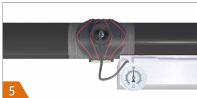
5 Once x3 cooling time has elapsed, test via central test nipple.