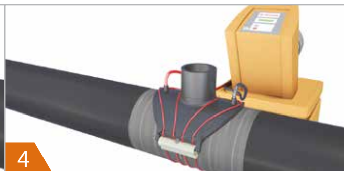
4 Connect EF box to fitting and fuse.