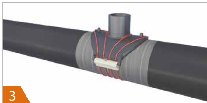
3 Once in position tighten firmly by hand with a 6mm hex allen key.