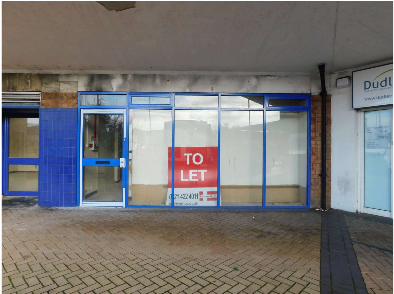
Unit 2, High Street, Lye, Stourbridge, West Midlands, DY9 8JT

TO LET - An opportunity to lease a lock-up ground floor premises, in prominent parade in Lye on the main crossroads. Suitable for a variety of uses subject to planning approval. EPC = C (60)