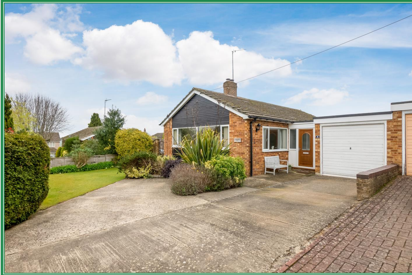
Hempton, Banbury, Oxfordshire