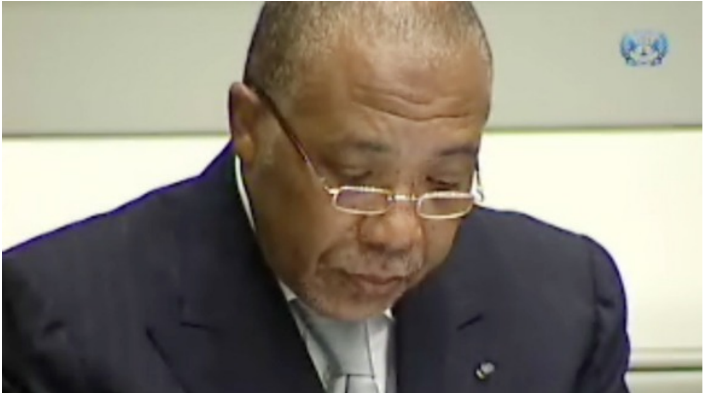
Ex-Liberian president Charles Taylor, convicted of war crimes in the Hague in 2012.

Former president of Liberia Charles Taylor has arrived in the UK to serve the remainder of his 50-year-sentence for war crimes, the BBC reports.