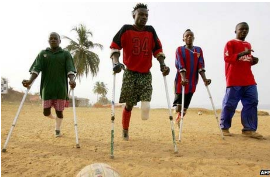
Many victims of Sierra Leone's civil war had limbs hacked off by rebels

Taylor has always insisted he is innocent and his only contact with the rebels was to urge them to stop fighting.