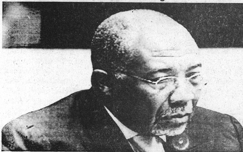
Charles Taylor is the first former head of state to be convicted of war crimes since World War II

Ex-Liberian President Charles Taylor has asked to serve his 50-year sentence for war crimes in Rwanda, rather than the UK. In a letter sent to the court that convicted him, he says it would be easier - and less expensive - for his family to visit him in Africa. He also said he feared being attacked in a British prison. Taylor was convicted of aiding rebels who committed atrocities in Sierra Leone during its civil war. Last week, a UK minister confirmed that Taylor would be transferred to a British prison. He was convicted by the UN-backed Special Court for Sierra Leone (SCSL), but his trial was held in The Hague in case it sparked renewed unrest in West Africa. The Netherlands only agreed to host the trial if he was imprisoned elsewhere.