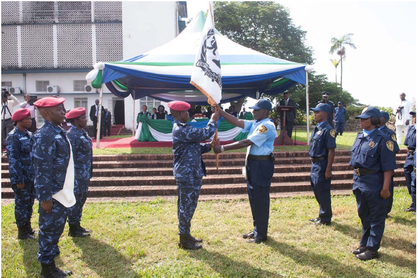
The handing over of the Special Court flag at State House