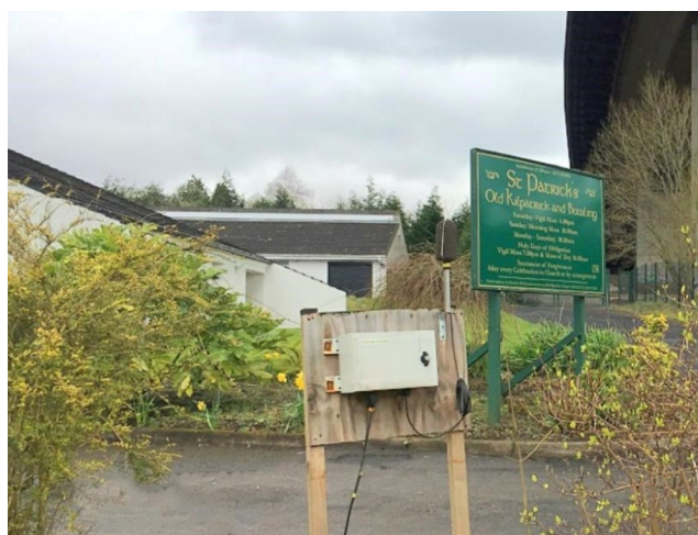
Monitex Noise Monitor in action at St Patrick's Church under the Erskine Bridge

As a result of all these factors, it was essential to monitor noise and vibration levels to ensure that sensitive areas of the environment were not disturbed and that concerns from local residents were alleviated.