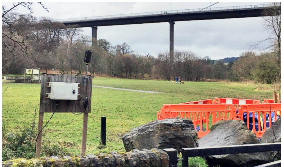
Monitex Noise Monitor in action at Boden Boo park, under the Erskine Bridge