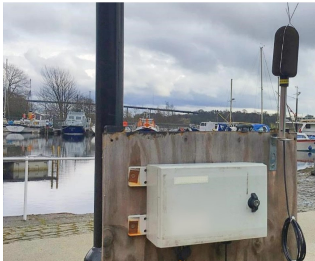
Monitex Noise Monitor in action at Bowling Harbour, Old Kilpatrick

A wide range of high power, high precision Horizontal Directional Drilling, Auger Boring and Micro Tunnelling techniques were required to replace the existing pipeline with the new 1.9km 39 bar pipeline. Open-cut installation of the pipeline was also undertaken, involving trench excavation using noisy plant.