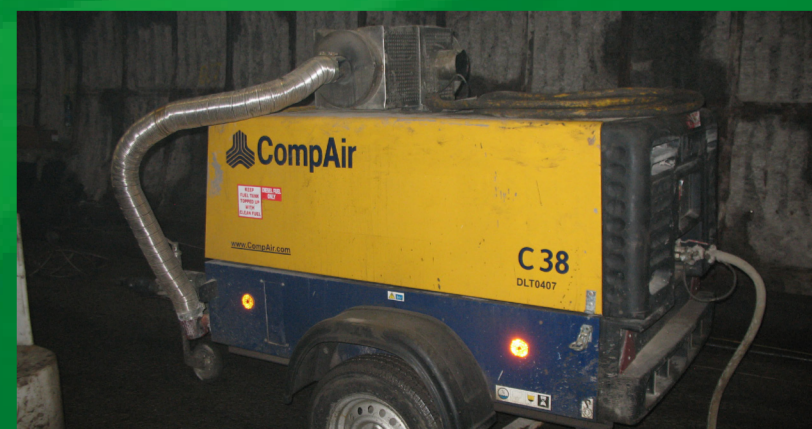
Exhaust fume filtration