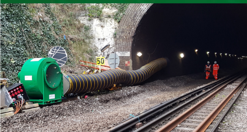
Centrifugal fan ventilation

Protect long-term health with hazard control and ventilation in confined spaces.