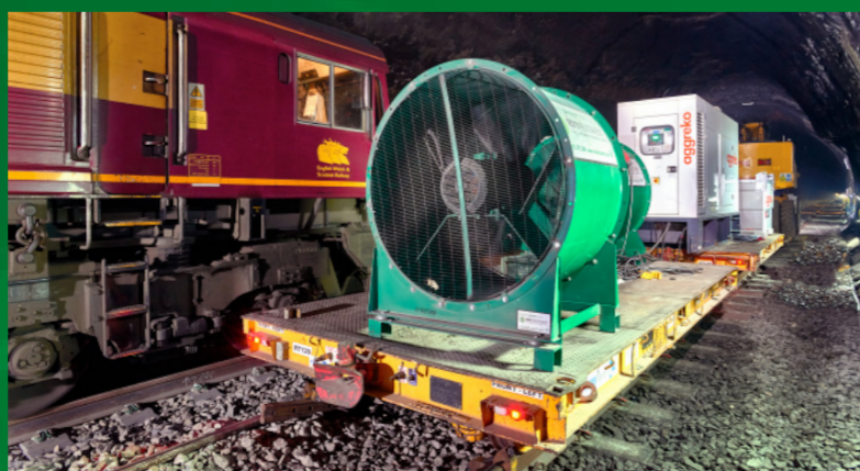
Axial fan ventilation