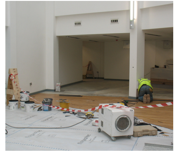
Example of electric heater used to dry out paint work and provide ambient heat whilst other trades continue working.