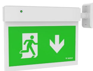
double sided side wall mounted