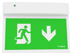
double sided ceiling mounted