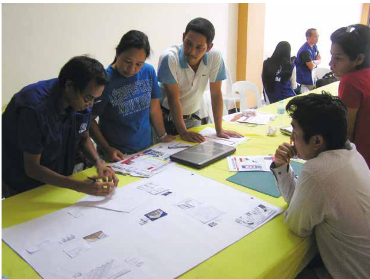
IEC TWG Typhoon Bopha 2012.