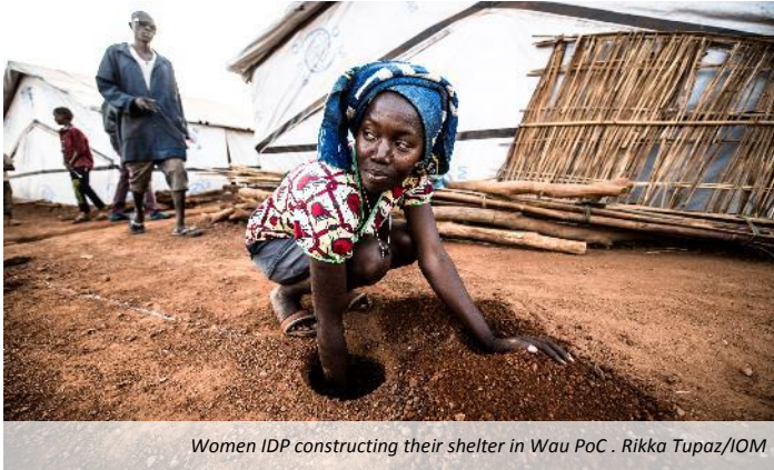
Women IDP constructing their shelter in Wau PoC.