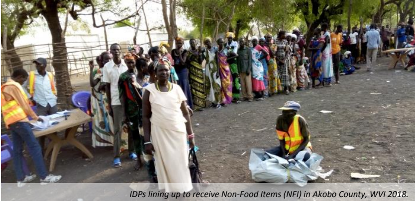
IDPs lining up to receive Non-Food Items (NFI) in Akobo County, WVI 2018.