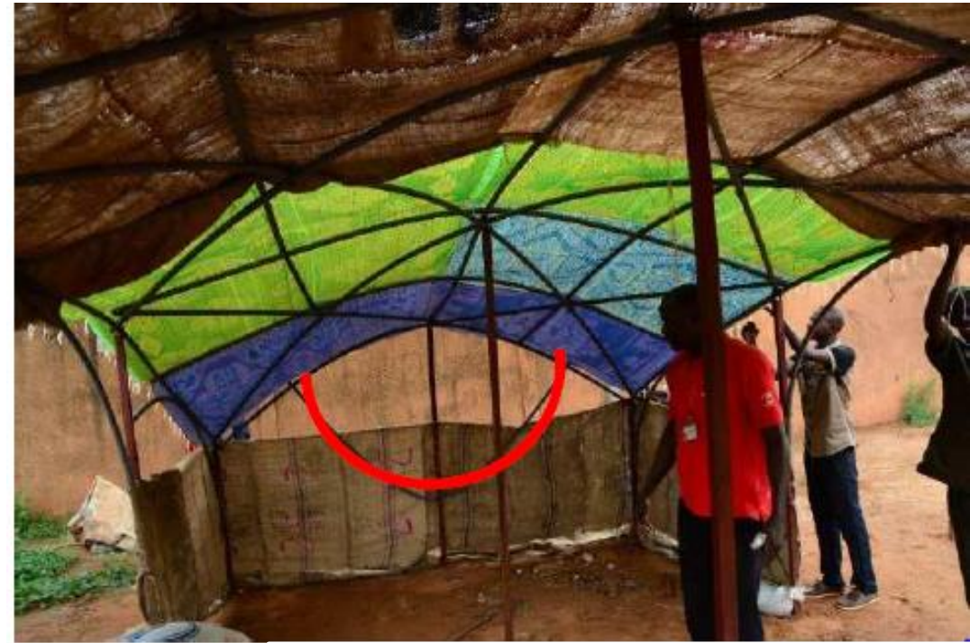
U-shape bracing with PVC tubes!