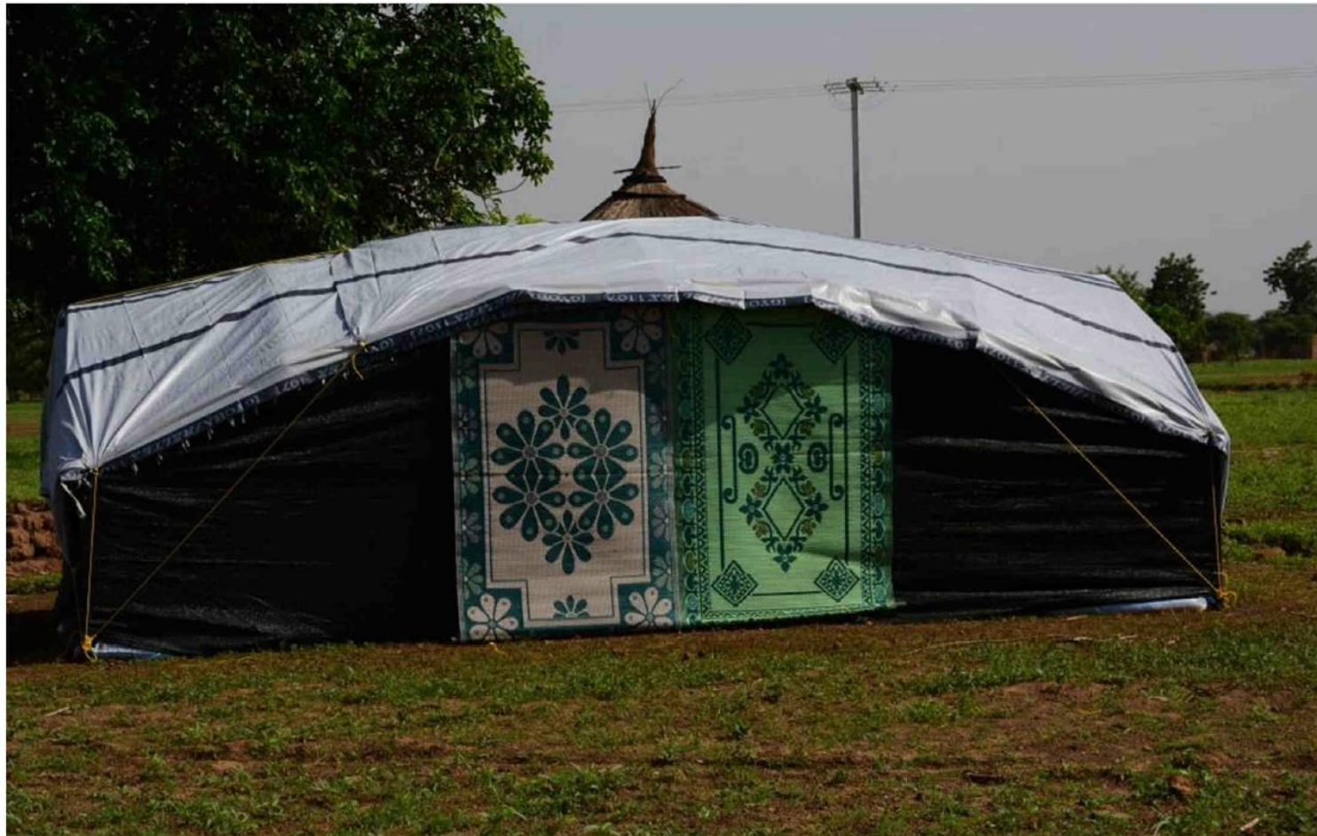
Doors with plastic carpets + ropes tensioned