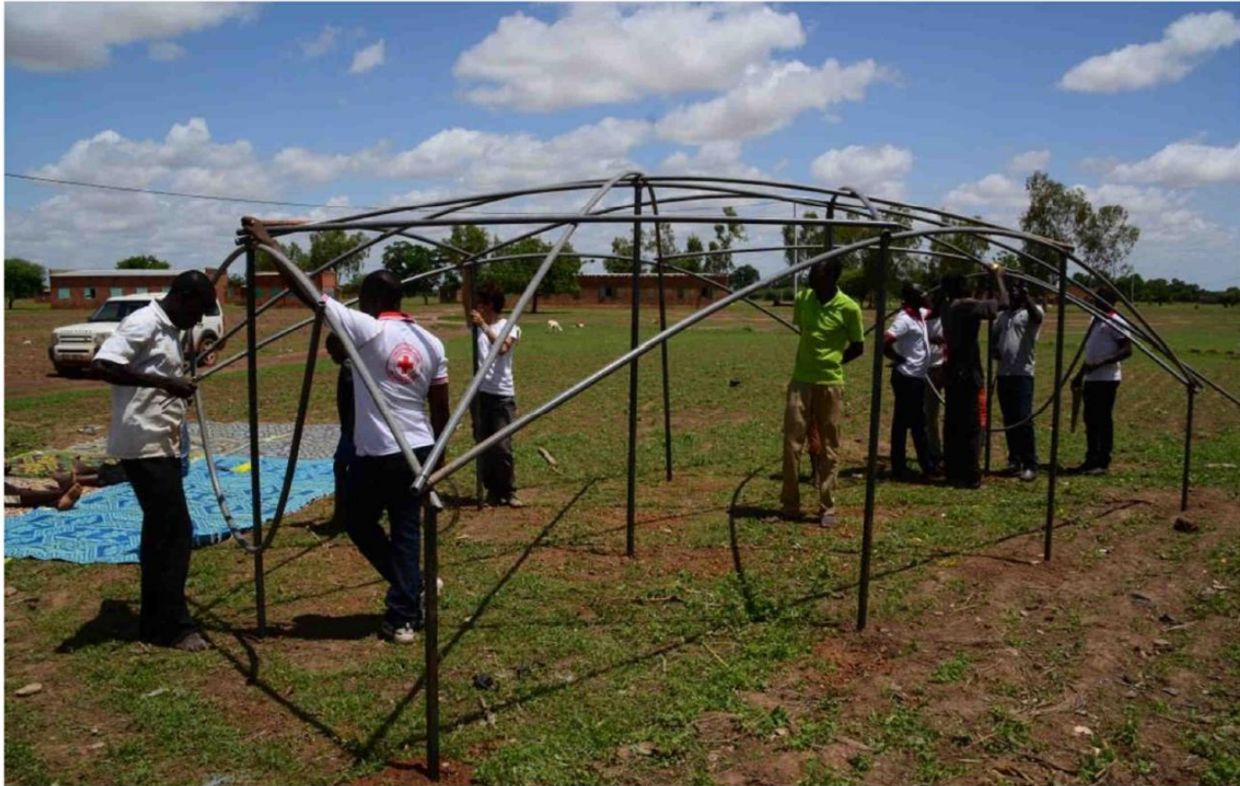
Dome – diagonals and reinforcements