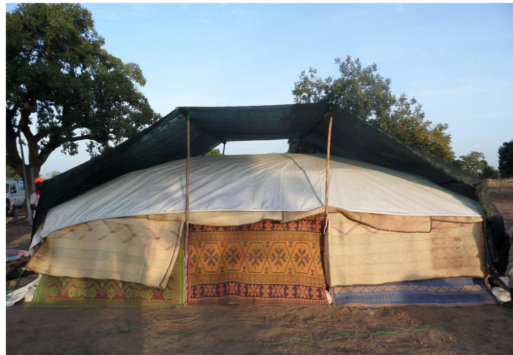
Variation with woven mats from local materials and upgraded with shade net