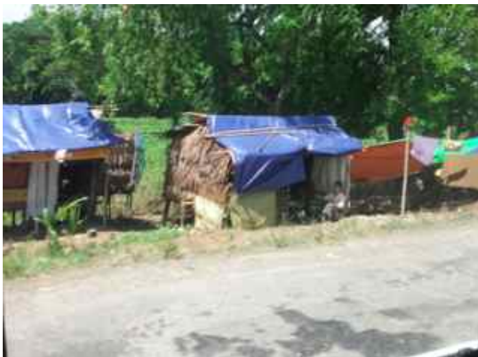
Roadside makeshift camps Ayeyarwady.

The number and status of persons displaced from their homes remains uncertain. SCT is initiating field trips and more importantly will request shelter partners to provide more detailed information via reporting templates to be shared within the next several days. (See details below).