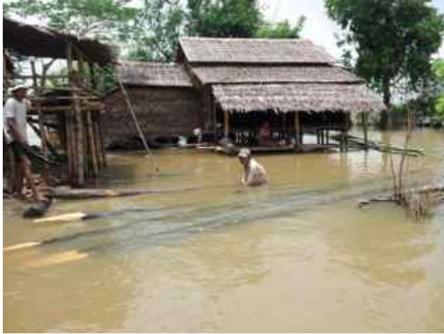
Village household's inundated in Ayeyarwady.

The focus is moving towards early recovery which is appropriate however concerns remain regarding the needs of those with seriously damaged houses or the needs of displaced households, many of whom are in temporary evacuation centers.