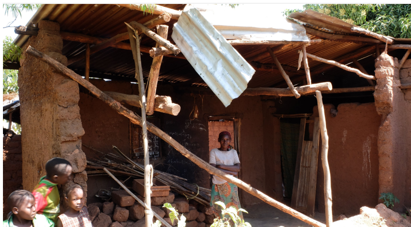
Population affected by natural hazards per province January to June 2018