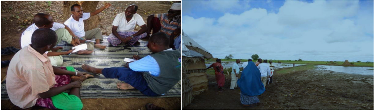
June, 2015

Building on the success of the Shelter Cluster mapping exercise, the Inter-Cluster Coordinating Group (ICCG) decided at the retreat in Mogadishu on the 15th of September 2014, to develop the Somalia Inter-Cluster Rapid Needs Assessment (SIRNA) tool. It is designed to serve as a standard, easily accessible inter-Cluster tool that can provide a comprehensive needs overview of a population after a crisis is first reported. SIRNA implementation requires: 1) notification of emergency, 2) deployment preparation, 3) deployment, 4) data collection, 5) data reporting, 6) cluster validation, 6) reporting revision, 7) publishing, and 8) diffusion/response.