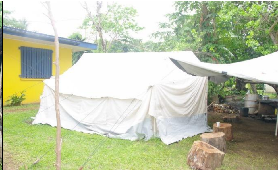
Location: Fire station