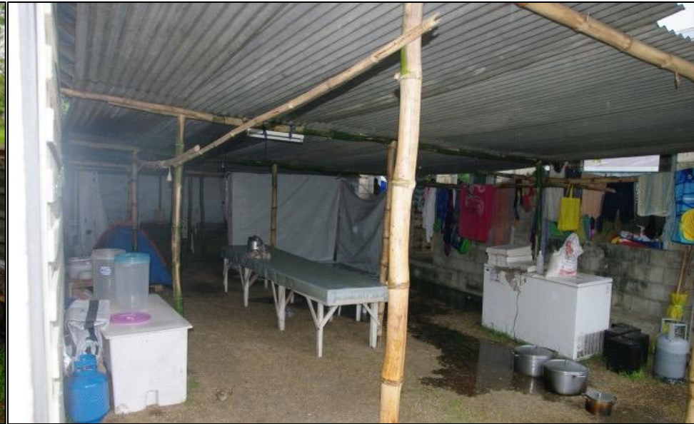
Location: Apostolic Sarakata