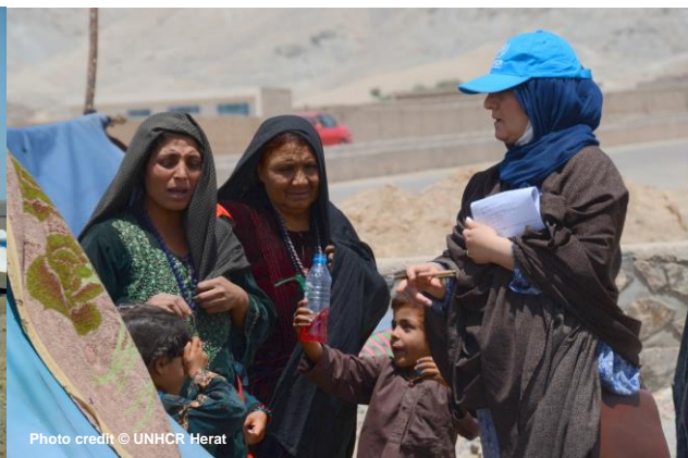
Drought affected IDPs assisted with emergency shelter packages