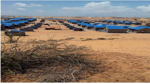
Two-room units constructed by CARE International – Kismayo Somalia