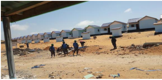
Two roomed Shelter under construction by NRC, funded by UNHABITANT- Kismayo Somalia