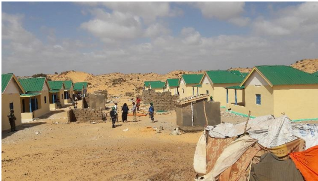
Photo: A two roomed permanent house.

The beneficiaries of the permanent 50 houses are returnees, IDPs and the host community; the houses are two-rooms, with a toilet and veranda. The selection of the beneficiaries will be happening soon and the relocation to after. The regional government and shelter partners are working on the criteria for the selection of beneficiaries.