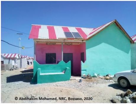
© Abdihakim Mohamed, NRC, Bossaso, 2020