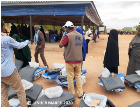
MARCH 2020 Distribution of NFIs by UNHCR to IDPs in Dolow