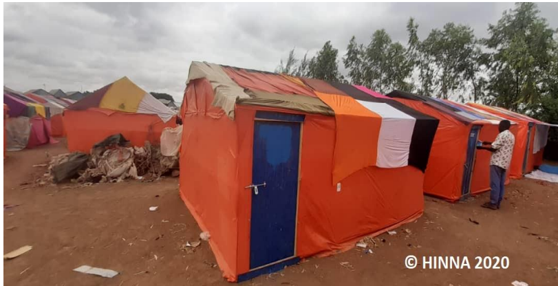
Photo: Typical Emergency shelter constructed for IDPs by HINNA featuring a lockable door.

The story discloses some very touching statements from some of the 566 beneficiaries of a shelter project implemented by HINNA through Somalia humanitarian pooled funds (SHF). Some of the statements are sampled below.