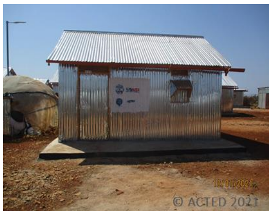
CGI Shelters constructed by ACTED in Baidoa