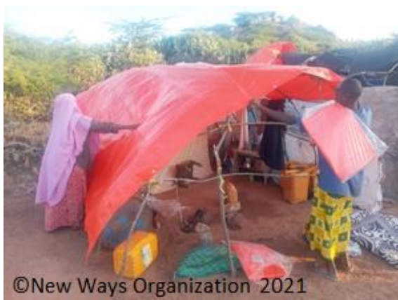
A makeshift Shelter constructed by DPs in Lower Shabelle using Plastic Sheets distributed by NWO