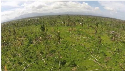
Yolanda Response, Philippines, 2013-2014