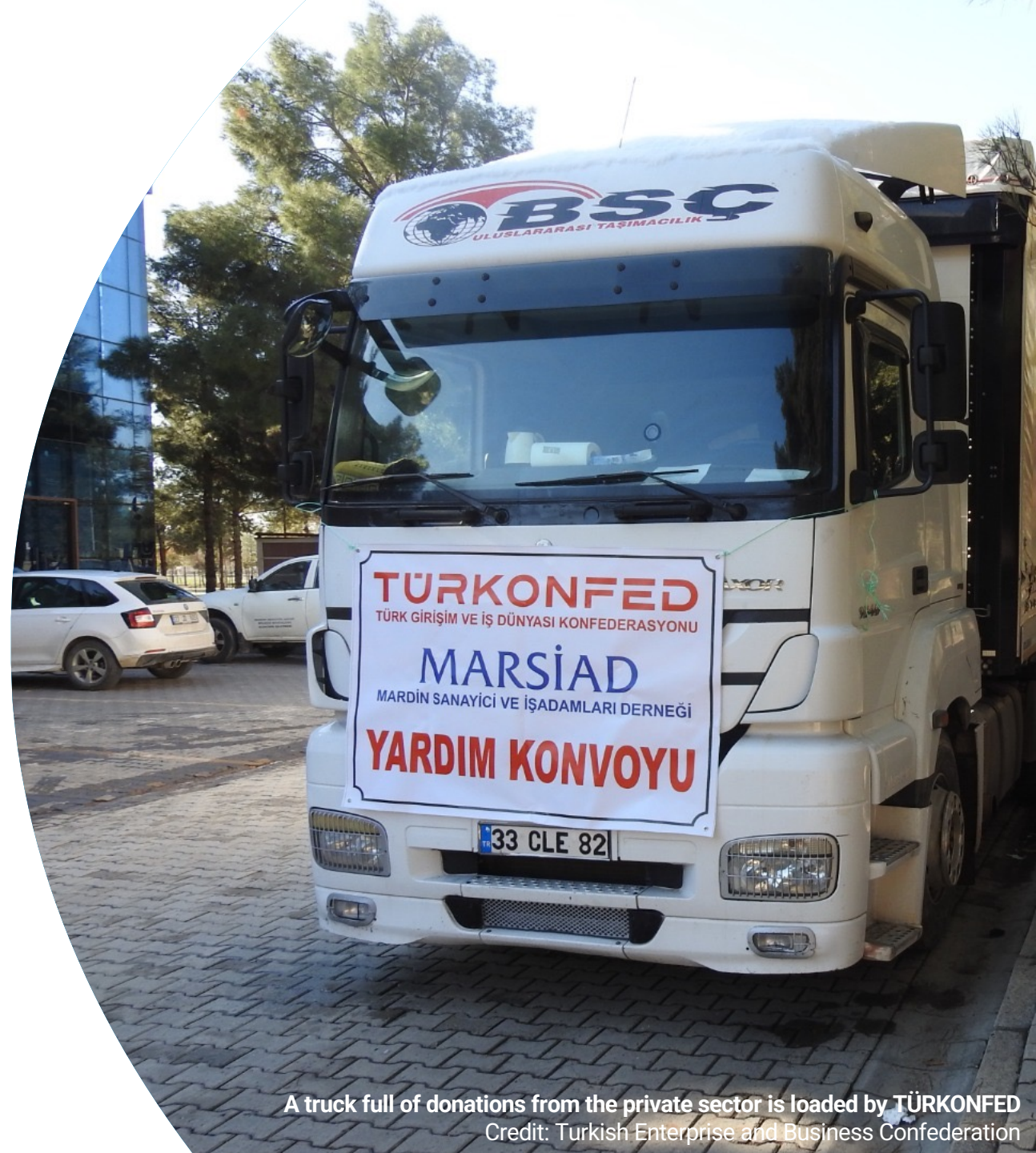
A truck full of donations from the private sector is loaded by TÜRKONFED